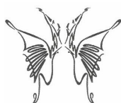
Butterfly Sterling Silver Charm (About 7/8") $30